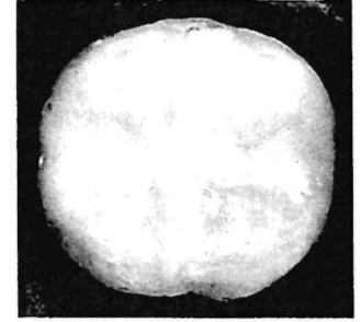
TOOTH AFTER SEALANT APPLICATION